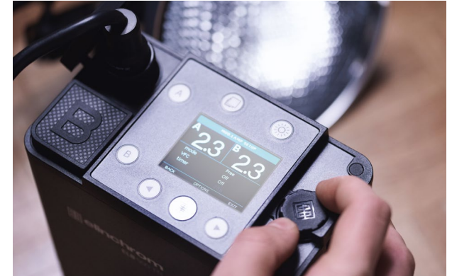
The modelling lamp settings are easily adjusted in the ELB 500 TTL menu.

In dark situations, using the modelling lamp to help focusing is a great idea. But this can drain the battery and depending on your light-shaper, it might not be powerful enough. Instead, you can use the AF assist feature of your Elinchrom Transmitter Pro to help you achieve precise focus.