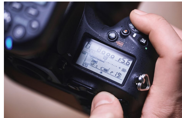
Using HSS, the ELB 500 TTL enables you to set a flash with camera shutter speeds of up to 1/8000s.

When you need to darken the environment or overpower the sun, take advantage of HSS. Simply increase your shutter speed above your x-sync and let the ELB 500 TTL do the rest. Any image can be fine tuned in manual.