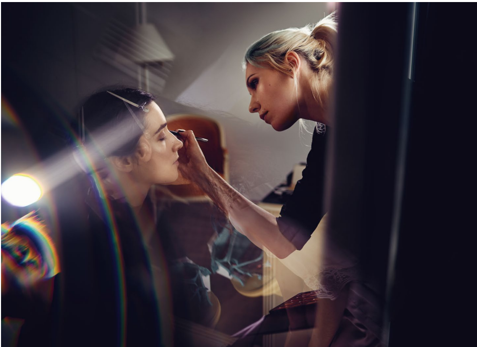
This shot was created using an Elinchrom ELB 500 TTL with one head, a standard 18 cm reflector, and a 20° grid. The setup of the battery pack is incredibly easy.

Before we get to the fun part of using the ELB 500 TTL, we have the Transmitter Pro to setup. Turn it on, press the TTL button on the bottom left of the screen and you are ready to go! Be sure to take a test shot before catching the moment. If you feel like the flash isn't matching your creative direction, simply adjust the exposure compensation on the Transmitter.