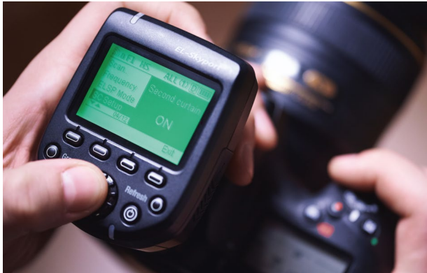
All the information you need is shown on the Elinchrom Transmitter Pro display.

The first step is to adjust my camera settings and make sure the environment is as dark or as light as I wish. Using Live View to speed up the process, I check the histogram as well as the live view feed and adjust the shutter speed, ISO, and aperture.