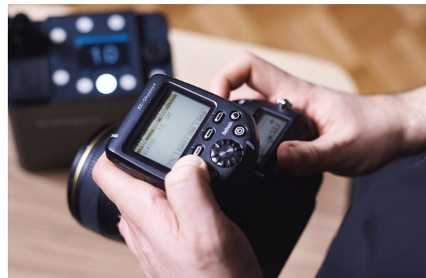
With the Elinchrom Pro Transmitter, easily switch your setup from TTL to Manual to adjust your settings.

Without TTL, when working in Aperture Priority mode, using flash can quickly show its shortcomings when shooting in a fast-paced environment such as a bride getting ready. In this setting, TTL will help you work faster and easier.