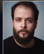
Quentin Décaillet is a photographer and retoucher specialising in beauty and creative portraiture based in Switzerland. Quentin is also a staff writer for FStoppers.com.