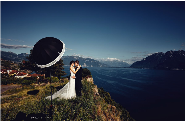
The shot was created using an Elinchrom ELB 500 TTL with one head, a silver deep umbrella 105 and the diffusion panel.

Once the camera is ready, you can control the flash with the Elinchrom Transmitter Pro. Turn it on, and then press the TTL button to leave most of the technical work to the Skyport System. Before firing multiple shots, be sure to capture a test picture and check that everything looks great. If the flash power isn't matching your wishes, adjust it using the dial.